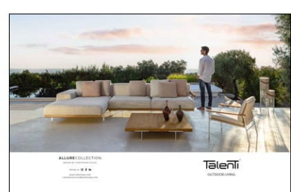
DOUBLE PAGE ADV double page example