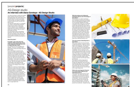
▲ [people&projects] example