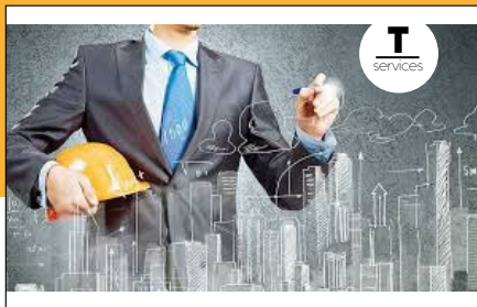
▲ DOUBLE PAGE ADV example

Gulf Countries Representative Build LLC Souk Al Bahar Old Town Island Burj Khalifa District Dubai - UAE