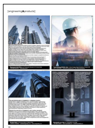
[engineering&products] example ▶