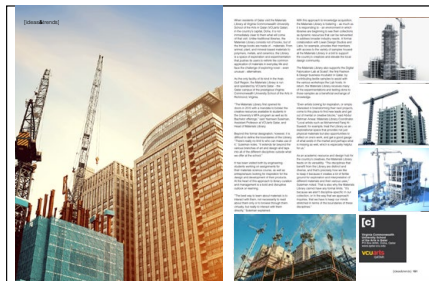
▲ [ideas&trends] example